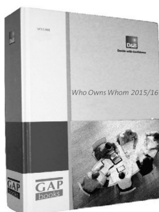
D&B Who Owns Whom 2015/16 The most comprehensive guide to the corporate structure of 2.5 million businesses worldwide. £680.00 per regional volume Published June 2015