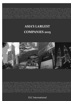
Asia's 10,000 Largest Companies 2015 The ideal solution for anyone who wants up-to- date financial and contact information on Asia's most important companies. £360.00 Published April 2015