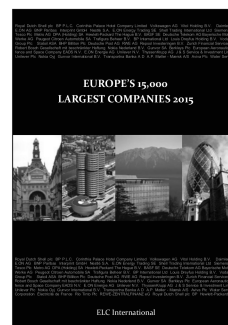
Europe's 15,000 Largest Companies 2015 The 'Black Book' is the comprehensive source detailing corporate intelligence on Europe's largest companies. £430.00 Published April 2015