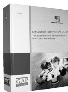
D&B Key British Enterprises 2015 Detailed, accurate & impartial information on the UK's top 50,000 companies. £875.00 Published March 2015